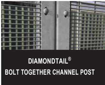
DIAMONDTAIL® BOLT TOGETHER CHANNEL POST