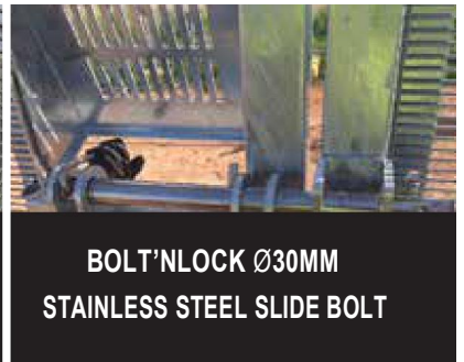
BOLT'NLOCK Ø30MM STAINLESS STEEL SLIDE BOLT