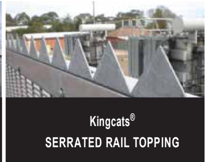
Kingcats® SERRATED RAIL TOPPING