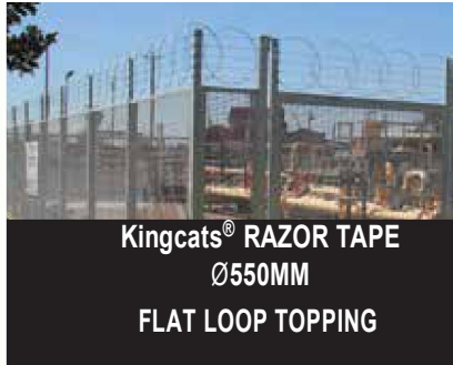
Kingcats® RAZOR TAPE Ø550MM FLAT LOOP TOPPING