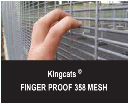
Kingcats® FINGER PROOF 358 MESH