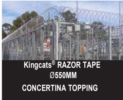
Kingcats® RAZOR TAPE Ø550MM CONCERTINA TOPPING